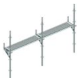
Assembly with AR console bracket 0.36 m